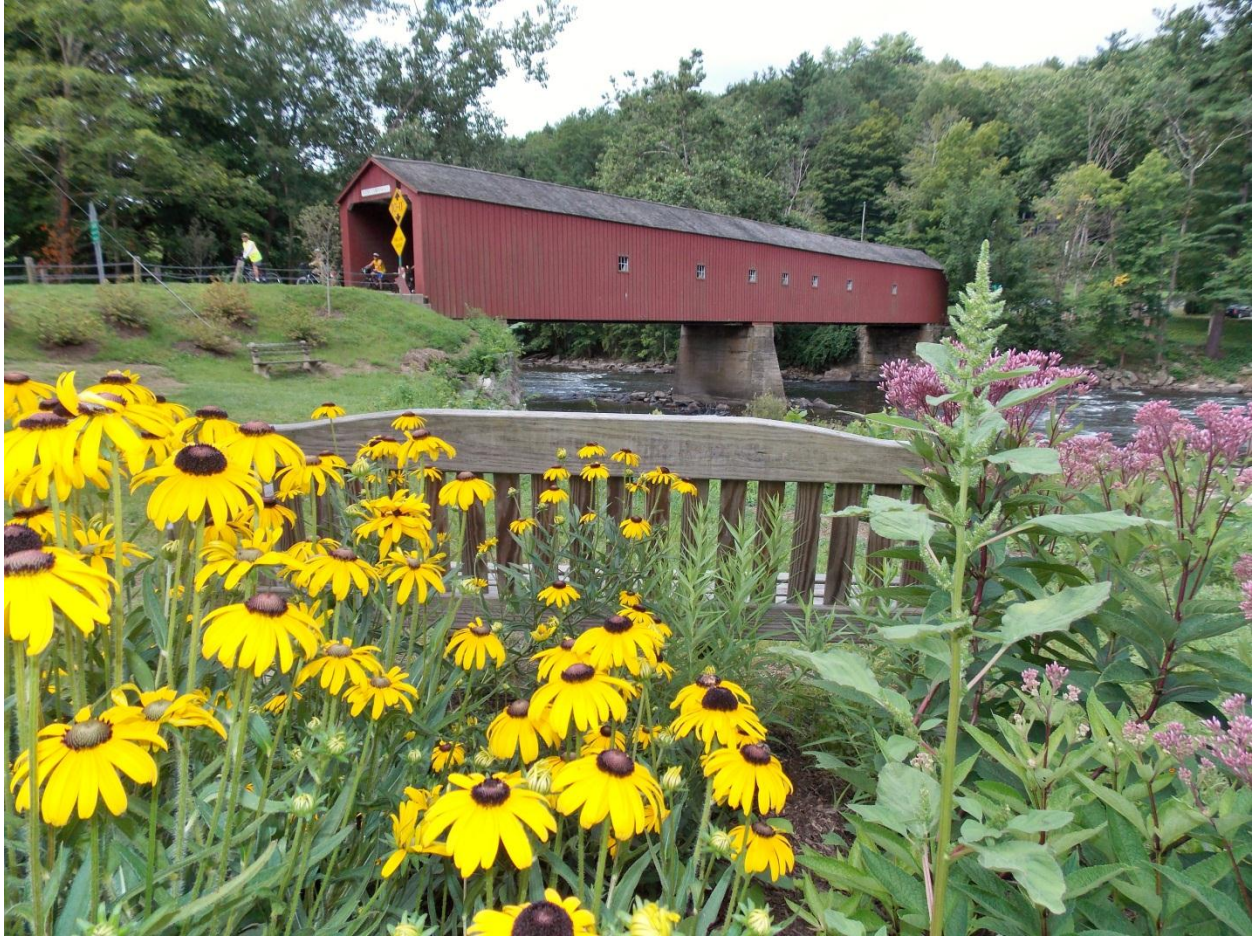
The West Cornwall Covered Bridge at a section of the Housatonic River between Salisbury and Cornwall that Ethan Allen often fished and travelled.

15.7 Turn LEFT at the stop sign onto Route 4 East / Cemetery Hill Road.