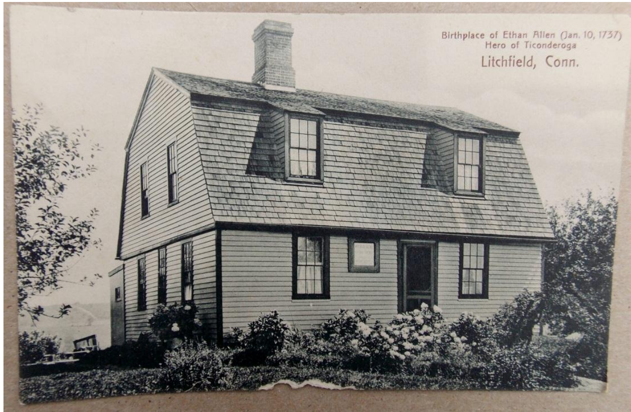
Postcard image of Ethan Allen's birthplace in Litchfield. Today the building has several additions, though the original house still stands and includes the original wooden floors.