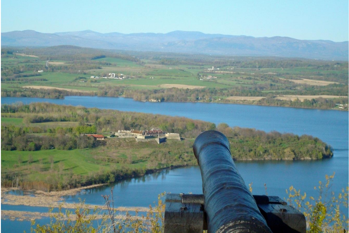
On May 10, 1775 Connecticut natives Ethan Allen and Benedict Arnold with the Green Mountain Boys captured Fort Ticonderoga. British General Gentleman “Johnny” Burgoyne positioned artillery on Mount Defiance in September 1777 to recapture the fort. Vermont “New Hampshire Grants” in the background with Lake Champlain and Fort Ticonderoga in the “Province” of New York in the foreground.