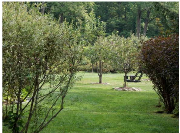
Oliver Wolcott lived in Litchfield, where his house still stands. He signed the Declaration of Independence, helped raise a Connecticut regiment for the Continental Army, and had a son who also served as governor of Connecticut. The garden behind the Wolcott House where Litchfield Patriots created bullets.