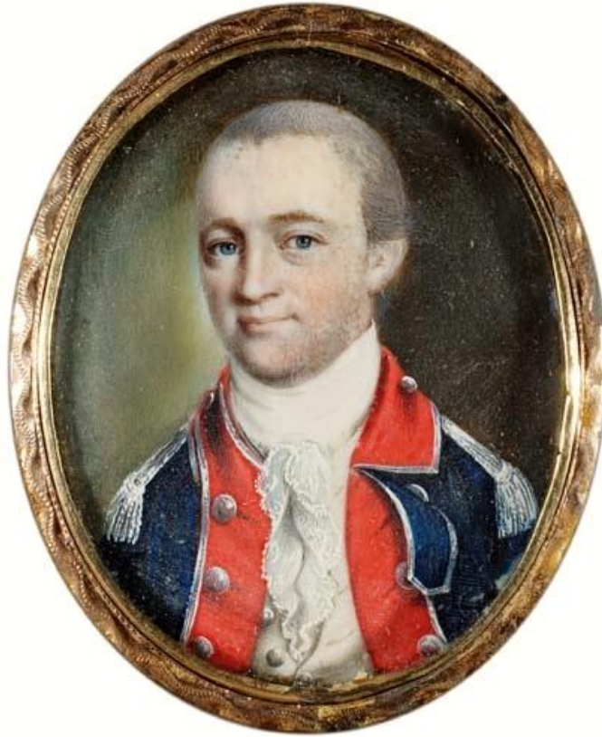
Portrait of General Benjamin Tallmadge, head of the Culper Spy Ring.

After visiting the Tallmadge and Wolcott graves, turn RIGHT out of the driveway onto Route 118 West.