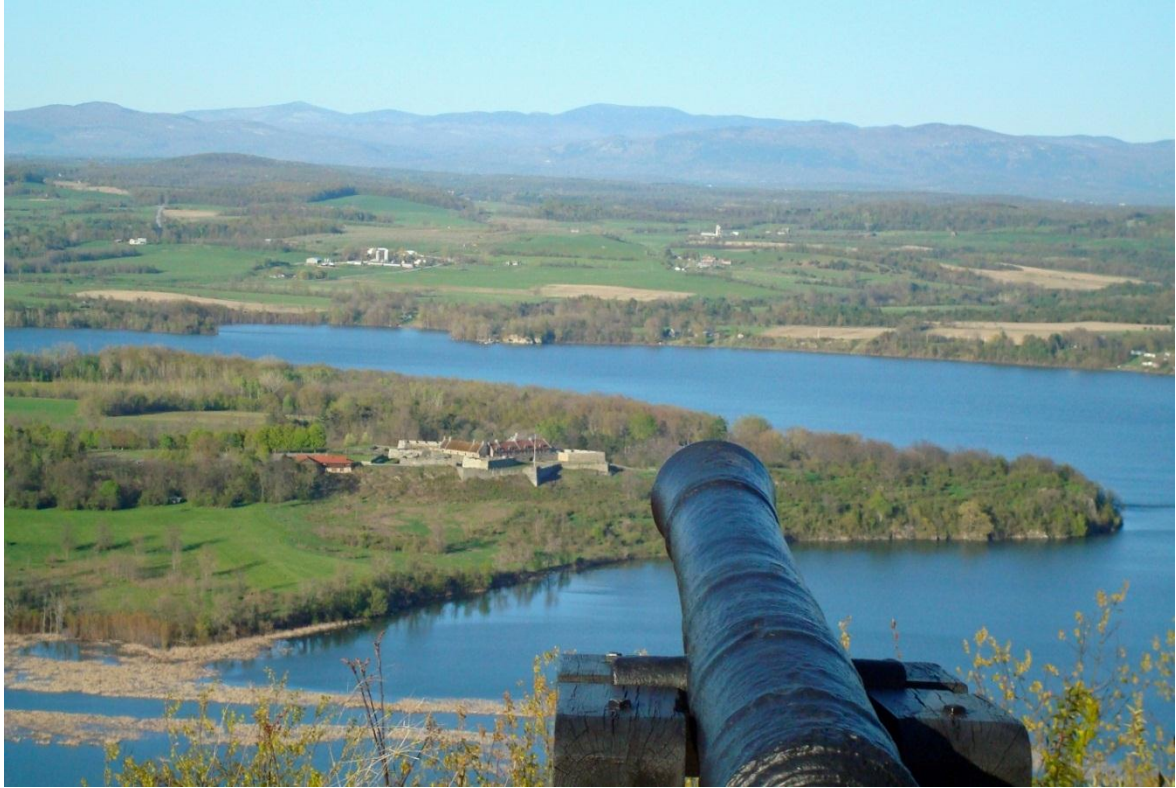
On May 10, 1775 Connecticut natives Ethan Allen and Benedict Arnold with the Green Mountain Boys captured Fort Ticonderoga. British General Gentleman “Johnny” Burgoyne positioned artillery on Mount Defiance in September 1777 to recapture the fort. Vermont “New Hampshire Grants” in the background with Lake Champlain and Fort Ticonderoga in the “Province” of New York in the foreground.