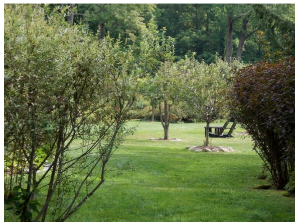
Oliver Wolcott lived in Litchfield, where his house still stands. He signed the Declaration of Independence, helped raise a Connecticut regiment for the Continental Army, and had a son who also served as governor of Connecticut. The garden behind the Wolcott House where Litchfield Patriots created bullets.